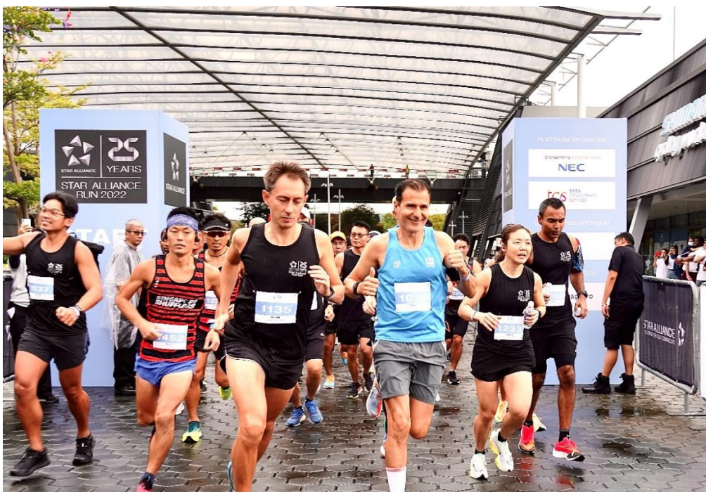
More than 1,000 runners participated in the Star Alliance Run 2022, in support of healthcare personnel working on the front lines against Covid.